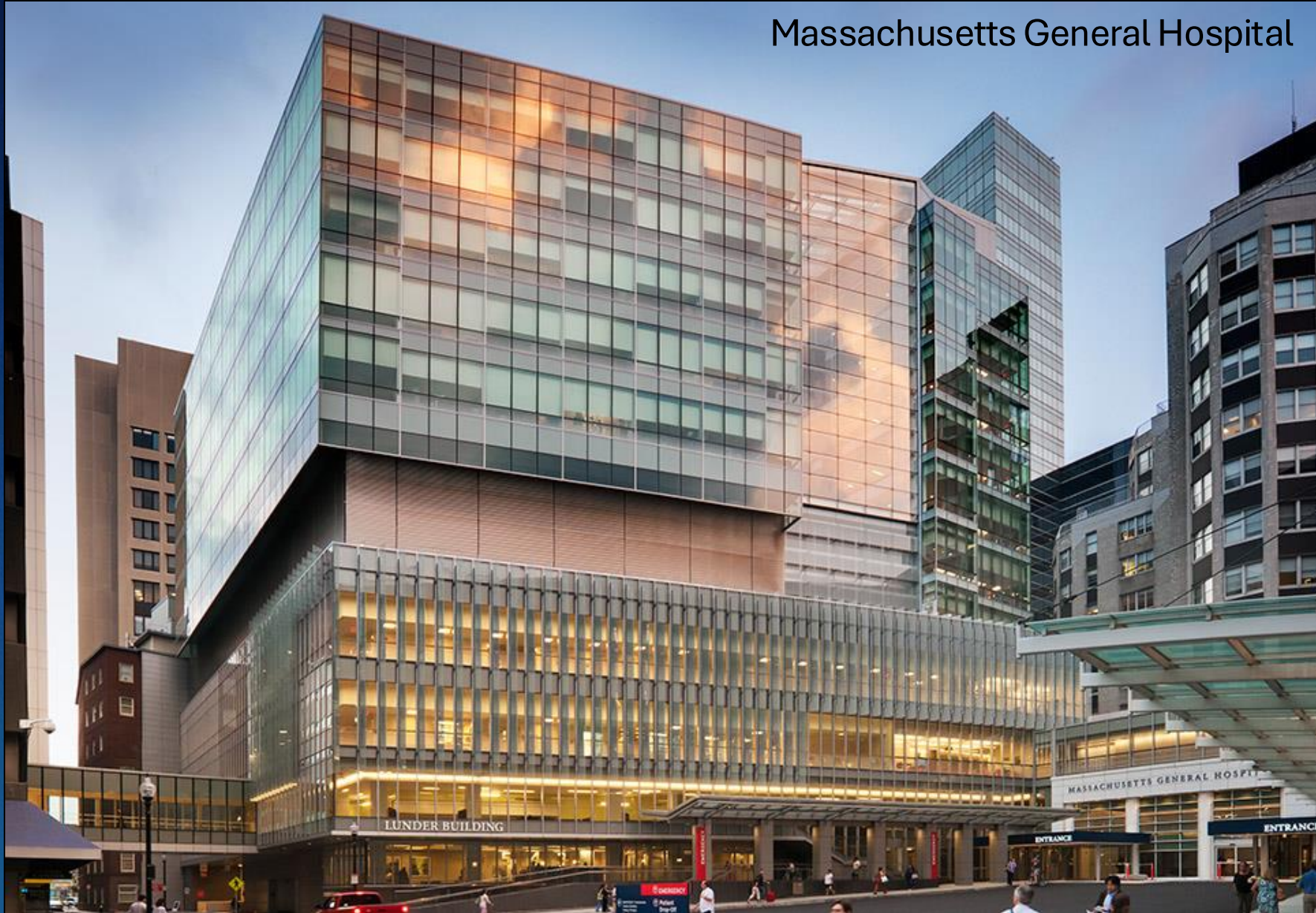
Massachusetts General Hospital